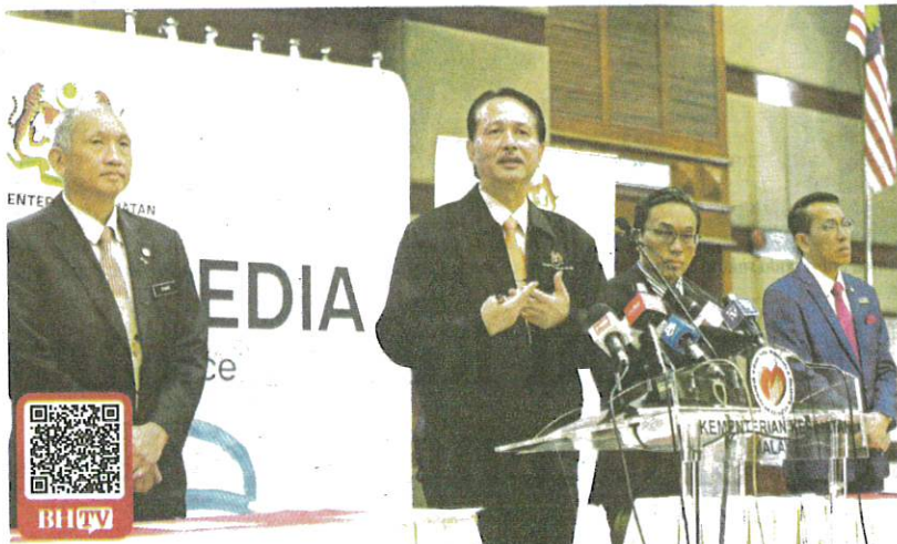
Dr Noor Hisham pada sidang media harian COVID-19 di Putrajaya, semalam.

Daripada jumlah kes baharu yang dilaporkan, dua kes adalah import yang mendapat jangkitan dari luar negara membabitkan warganegara Malaysia, manakala 13 kes penularan da-