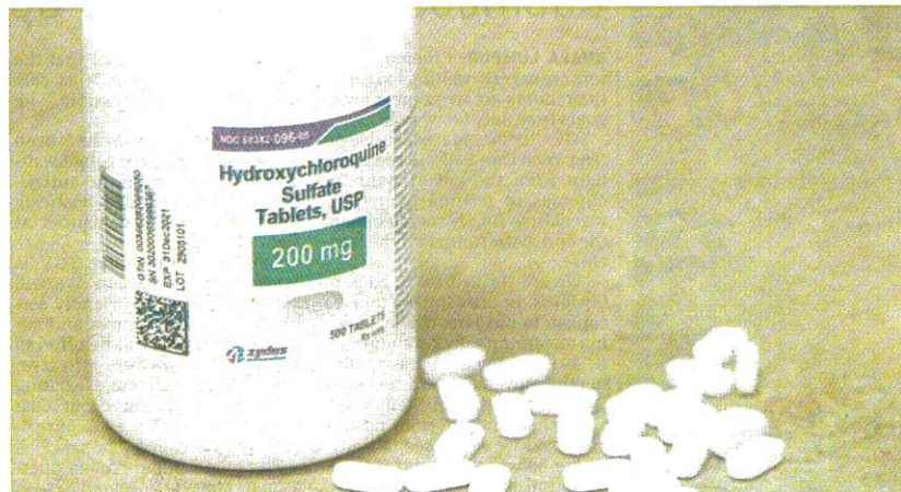
Hydroxychloroquine has no effect on Covid-19 patients.