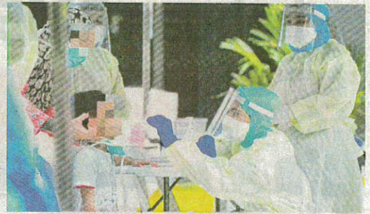
Orang ramai dinasihatkan tidak membawa kumpulan berisiko terutama kanak-kanak untuk melakukan lawatan pesakit di di hospital.

Beliau berkata, pertambahan kes baharu itu menjadikan jumlah kumulatif positif Covid-19 meningkat kepada 8,587 kes. "Sebanyak 289 kes yang masih dirawat di hospital," katanya. Beliau berkata, hanya dua pesakit Covid-19 dirawat di unit rawatan rapi dan tidak memerlukan bantuan pernafasan. "Tiada pertambahan kes kematian berkaitan Covid-19 dilaporkan pada hari ini. Jumlah kumulatif kes kematian Covid-19 adalah kekal 121 kes bersamaan dengan 1.41 peratus