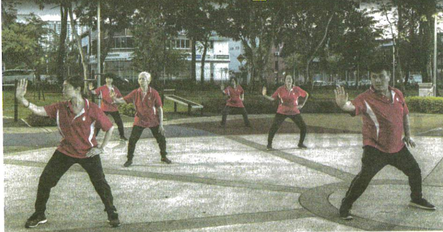
PENDUDUK Taman Sri Rampai, Setapak melakukan senaman tai chi dengan mengamalkan penjarakan sosial bagi mencegah penularan Covid-19 ketika tinjauan di sekitar ibu kota, semalam.